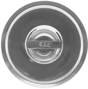
SBAM Cover Series