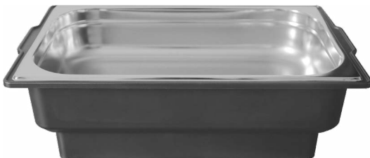
ELWP-1 with 1/1 Size GN Pan *GN pan sold separately